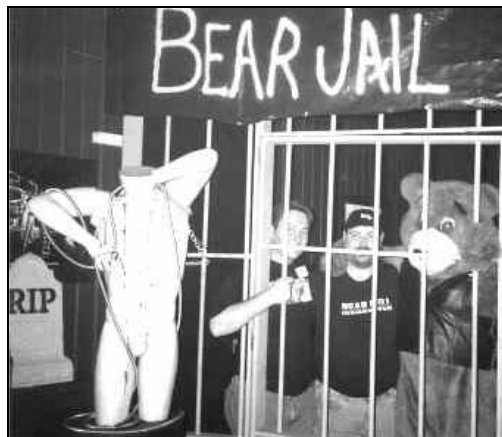
The BEAR JAIL with BEAR Prisoners.