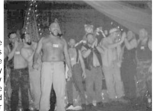
Well, with all these bears, someone should be commended for building such a sturdy stage!

Columbus Ursine Brotherhood was the host for the after hours party for Saturday night, and there was food and beer for everyone not exhausted by the day's activities. Between the two after hours party, everyone was sure to be on Santa's naughty list this year.